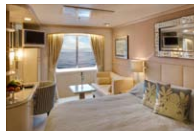
E Deluxe Stateroom with Picture Window