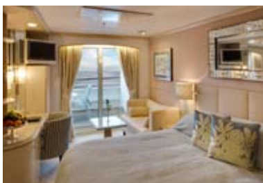
A Deluxe Stateroom with Verandah

*Cruise only fares in US$, per person, based on double occupancy. Fares include port, security and handling charges of US$305.00 per person.