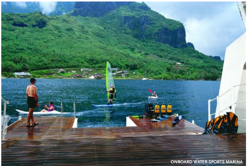
ONBOARD WATER-SPORTS MARINA

Nowhere else is the French art de vivre more evident than in the sensory pleasures of our moveable feasts.