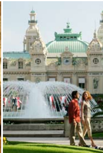
Jewels of the Cote D'azure