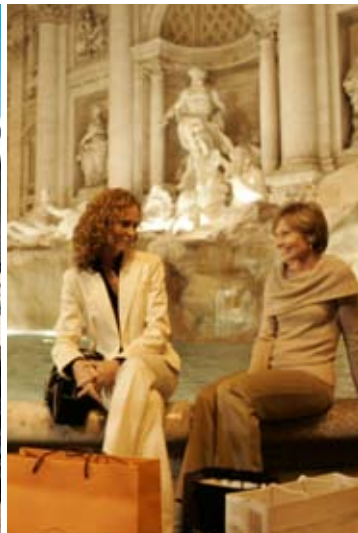
Rome On Your Own